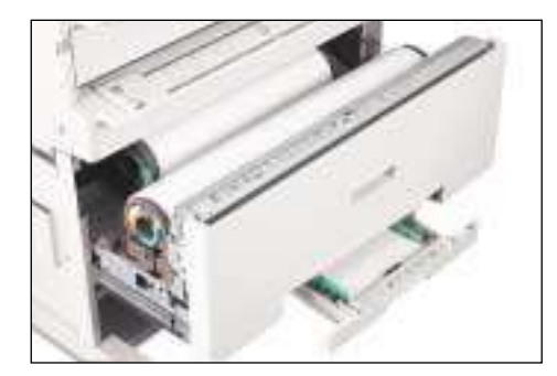
Easy to change paper at three automatic-feed sources