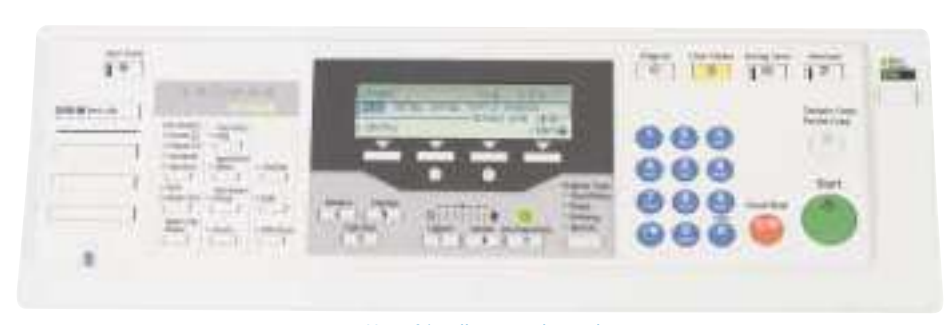
User-friendly control panel

it keeps shading faithful. The Aficio 240W also enables users to fine-tune copies. By selecting the nature of the original — Text/Photo, Photo, Drawing, or Special — the Aficio 240W automatically adjusts image quality for each specific original type.