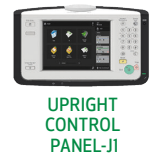
UPRIGHT CONTROL PANEL-J1