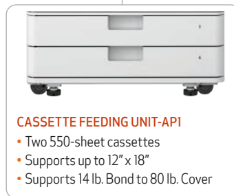
CASSETTE FEEDING UNIT-API