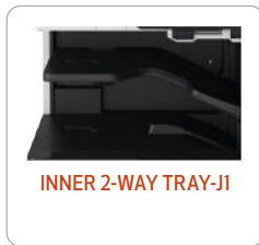
INNER 2-WAY TRAY-J1