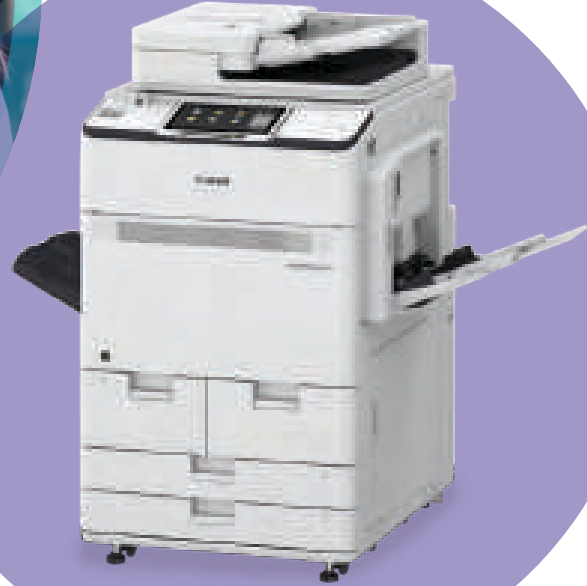
imagePRESS Lite C265 shown with optional Long Sheet Feeding and Catch Tray-B1.