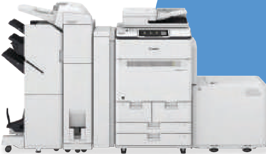
imagePRESS Lite C270 shown with optional accessories.