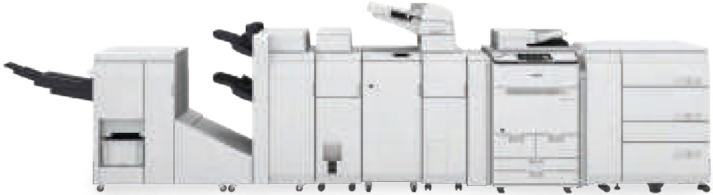
imagePRESS Lite C270 shown with optional accessories.

From professional punching to folding and saddle-stitching, you can fulfill more requirements and help increase customer satisfaction, all while keeping more work in-house.