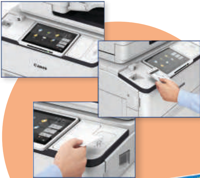
Optional accessories shown above.

Each business has its specific needs and Canon's MEAP platform enables the system to incorporate unique applications, such as cost-recovery and document distribution solutions. Once activated, uniFLOW Online Express, a standard cloud solution, displays activity in an information-packed, centralized dashboard that provides up-to-the-minute insights into print activity.