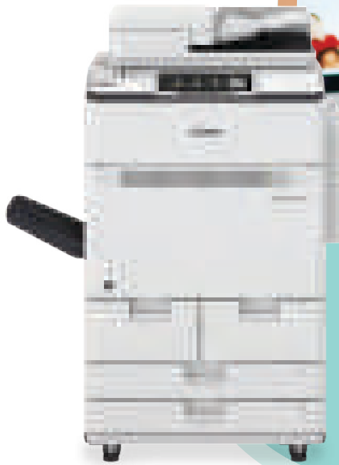
imagePRESS Lite C270 shown with optional accessories.