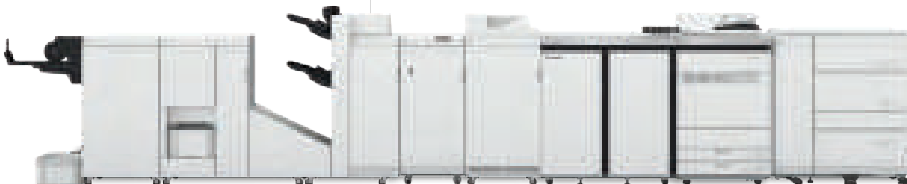
imagePRESS VI000 shown with optional accessories.