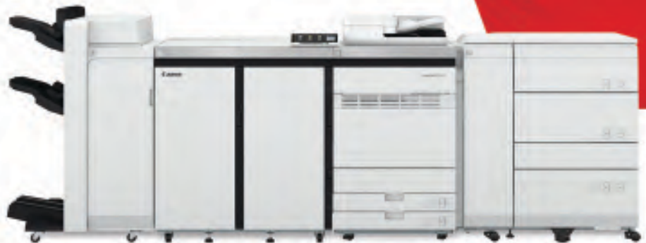
imagePRESS V1000 shown with optional accessories.