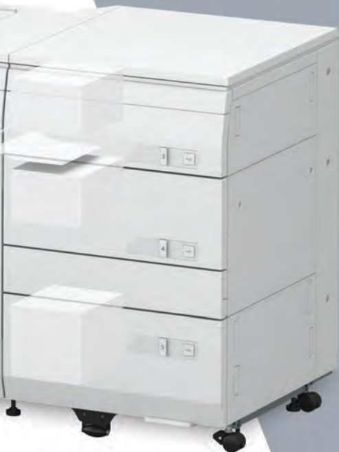
imagePRESS V1000 shown with optional accessories.