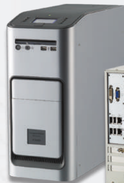
imagePRESS Server F200