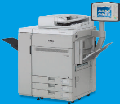
imagePRESS C65 shown with optional accessories.