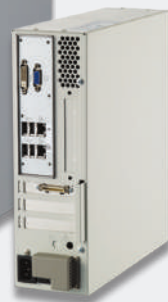
imagePRESS Server G100