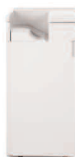
FD5000 Multi-Folding Unit