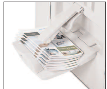
Use the Saddle-Stitch Finisher to create saddle-stitched booklets for handouts, educational and training materials and many other applications.