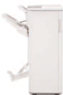
SR4040 2,000-Sheet Saddle-Stitch Finisher with 50-Sheet Stapler