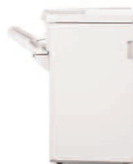
SR4050 3,000-Sheet Finisher with 100-Sheet Stapler