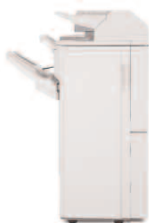
SR4030 3,000-Sheet Finisher with 50-Sheet Stapler and Cover Interposer Tray Type 3260

Create a configuration that delivers the options your customers need. Choose from 3 different types of optional finishers and a Cover Interposer.