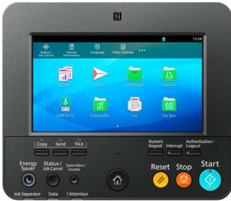
CS 508ci / 408ci / 358ci control panel