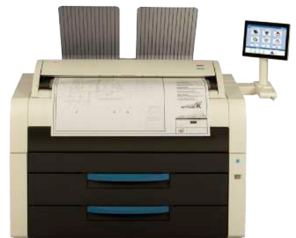
KIP 7980 MFP