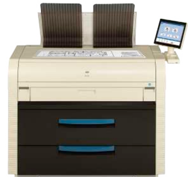
KIP 7570 Print Systems

(Note: KIP Scan Systems cannot be placed on top of the 75 Series)