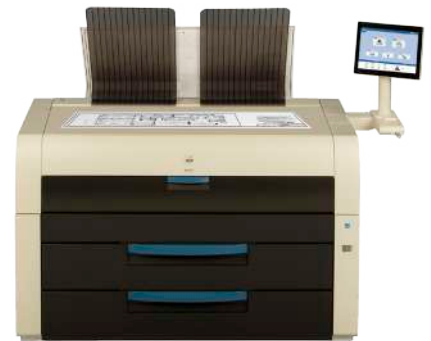
KIP 7970 Print Systems