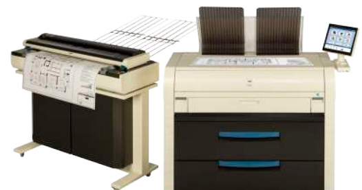
KIP 7590 Production MFP

(Note: KIP Scan Systems cannot be placed on top of the 75 Series)