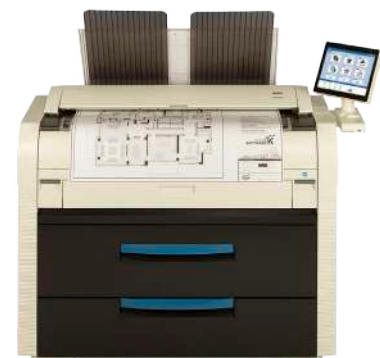
KIP 7580 MFP