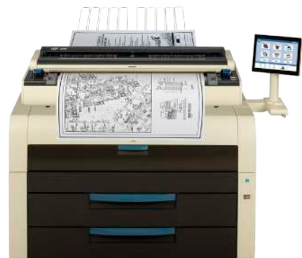
KIP 7990 Production MFP