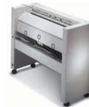
KIP 300 Stacker Stacks up to 350 A-E size prints/copies