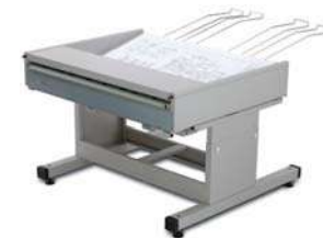
KIP 1200 Stacker Stacks up to 1000 A-E size prints/copies