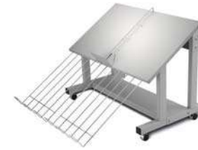
KIP 200 Stacker Stacks up to 250 A-E size prints/copies