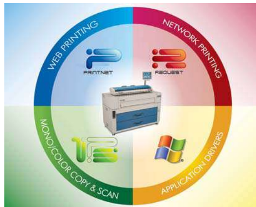
Integrated and Powerful Wide Format Imaging Software

KIP PrintNET Key Features: ■ The integrated PrintNET viewer displays accurate graphics, photos and fine lines ■ Create print jobs from Windows, Apple, Novell and Unix/Linux based web browsers ■ User name and password authentication system designed for maximum network security ■ Apply printing preferences on a per-file basis or to a complete print job ■ Accurate individual, departmental and project specific accounting information ■ Operates in mixed environments of client PC operating systems