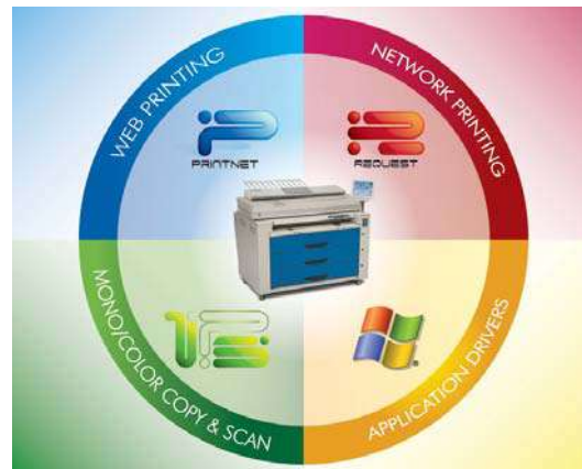
Integrated and Powerful Wide Format Imaging Software

The KIP Image Processing System is a combination of processing power and flexible software applications designed for maximum productivity and ease-of-use. Applications are available on PC workstations, over the internet and at the KIP 9000 touch screen operator panel, providing a uniform user interface across the entire KIP digital product range. All applications have been designed to provide exceptional versatility, fast file processing and efficient use of network resources to maintain high productivity.