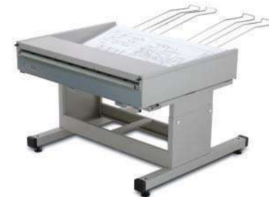
KIP 1200 Stacker Stacks up to 1000 A-E size prints/copies