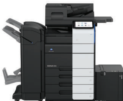
bizhub i-Series C650i