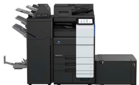
bizhub i-Series 750i