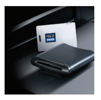
The bizhub 754 & 654 offer a full array of standard safeguards as well as advanced options like Biometric Authentication Unit, HID Proximity Cards, and other powerful options to guard your bizhub from unauthorized use.

An optional Copy Guard system requires password access to make copies. HDD Lock applies password protection to your bizhub hard disk drive. Job Erase function automatically overwrites your HDD up to three times, meeting the criteria of DoD 55220.22-M (Department of Defense) and NAVSO P-5239-26 (US Navy). And when your bizhub is reassigned to another location or removed from service, HDD Sanitizing can overwrite data in eight different modes so no sensitive information can be compromised.