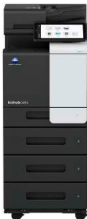
bizhub i-Series C4751i