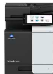
bizhub i-Series C3351i