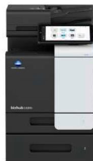
bizhub i-Series C4051i