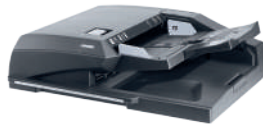
DUPLEX DOCUMENT PROCESSOR DP-772 Scans double-sided documents in one path.