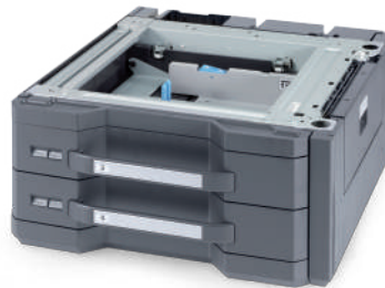
1000-SHEET PAPER FEEDER PF-730 Ideal for paper sizes between A5 and "12x18" (305x457)