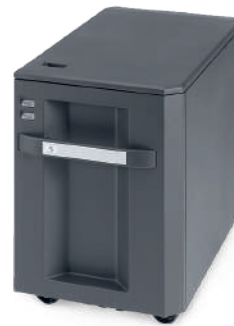
3000-SHEET PAPER FEEDER PF-770 Ideal for large A4 print runs.