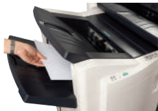
Post insertion staple up to 50 sheets is available with both finisher options