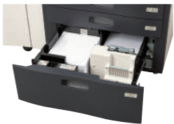
Standard 2,320 sheet paper tray allows paper to be loaded while running