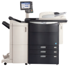
Configuration shown includes 3,000 sheet Saddle-Stitch Finisher 56.0" W x 30.7" D x 60.7" H