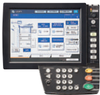
10.4" color touch screen Control Panel with one-touch access to common features