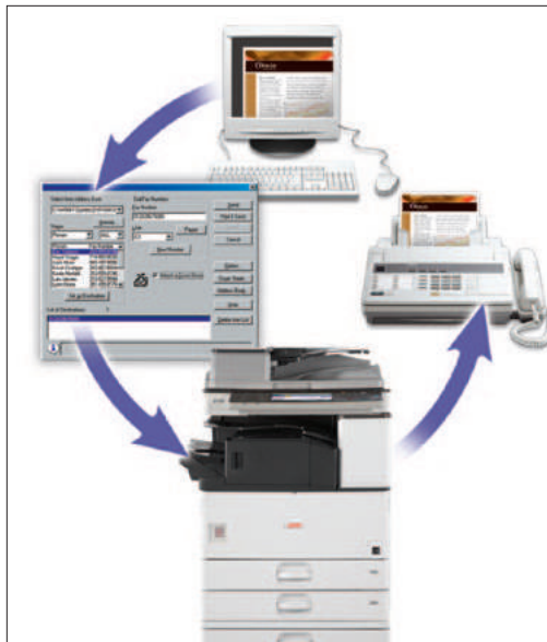
Fax documents right from your desktop to maximize convenience and boost efficiency.