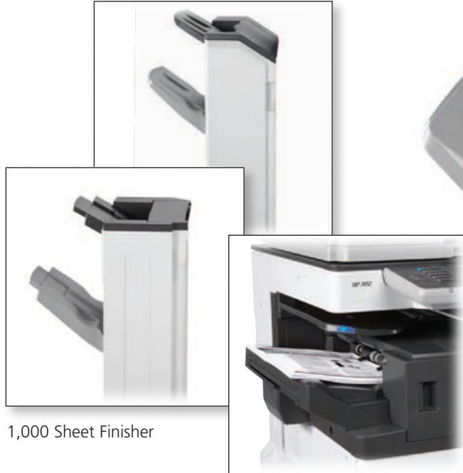
1,000 Sheet Finisher