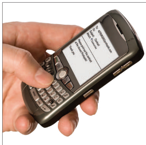
Print from mobile devices to HotSpot-enabled MFPs and printers for fast, convenient printing on the go.