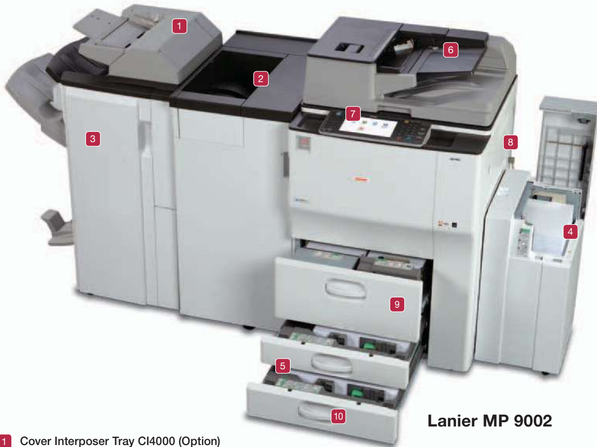
Lanier MP 9002