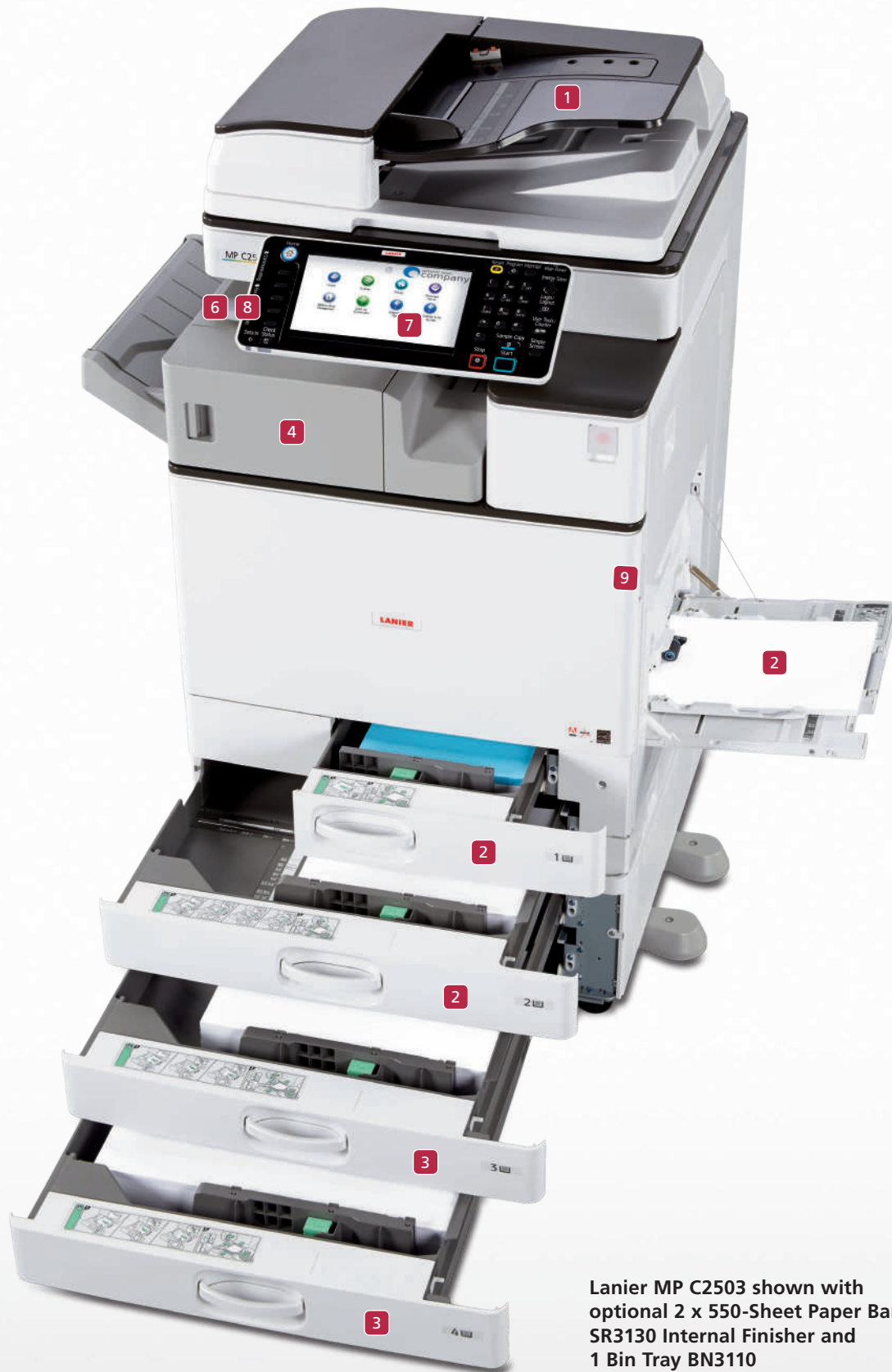
Lanier MP C2503 shown with optional 2 x 550-Sheet Paper Bank, SR3130 Internal Finisher and 1 Bin Tray BN3110