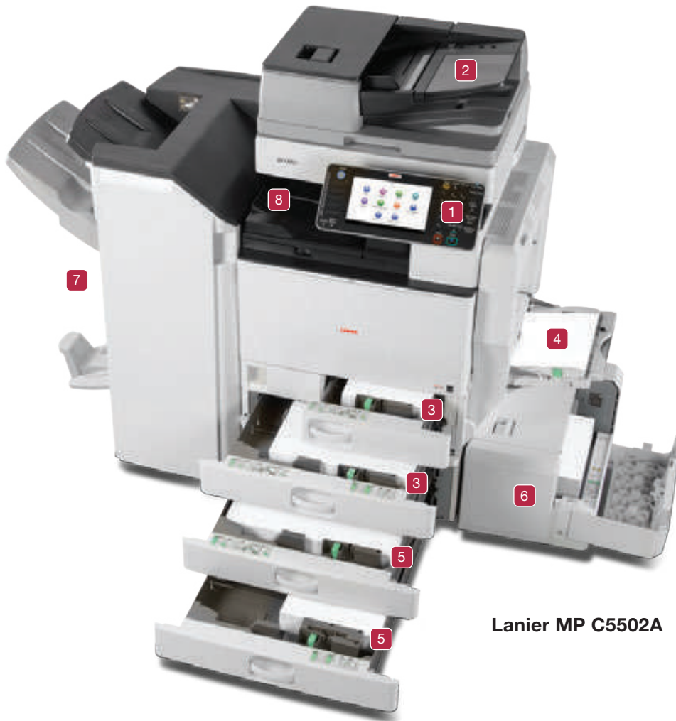
Lanier MP C5502A