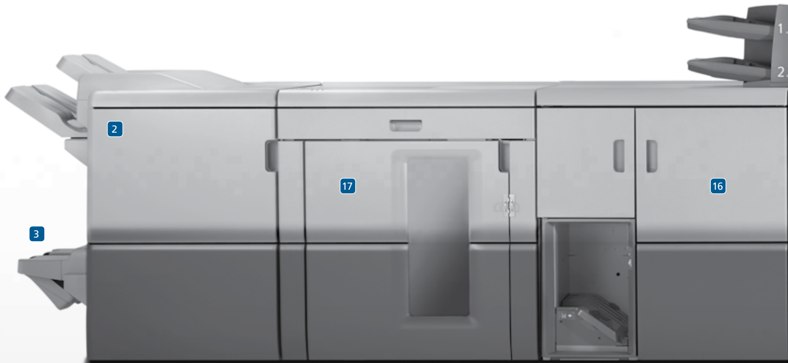
SAVIN Pro 8100 Series