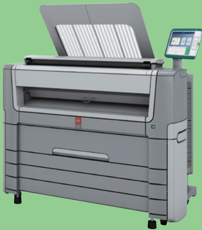
WITH OPTIONAL SCANNER EXPRESS II (MULTIFUNCTION SYSTEM)

Being able to submit files to your large format printer from anywhere can give you a big advantage when time is tight and deadlines are looming. The Océ ClearConnect software suite gives you more flexible ways to submit files to the printer. Print from your desktop via Océ Publisher Select™ software to manage complex document sets. With Océ Publisher Mobile, print from your smartphone or tablet when you are rushing to a meeting. Knowing you can print when you need to, can take some of the stress out of your work day.