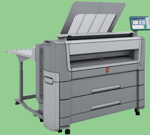
MULTIFUNCTION SYSTEM WITH OPTIONAL OCÉ DELIVERY TRAY AND OPTIONAL MEDIA DRAWER