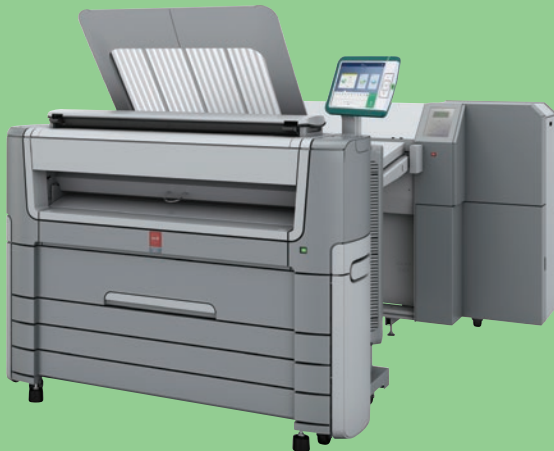
MULTIFUNCTION SYSTEM WITH OPTIONAL OCÉ 4312 FULLFOLD