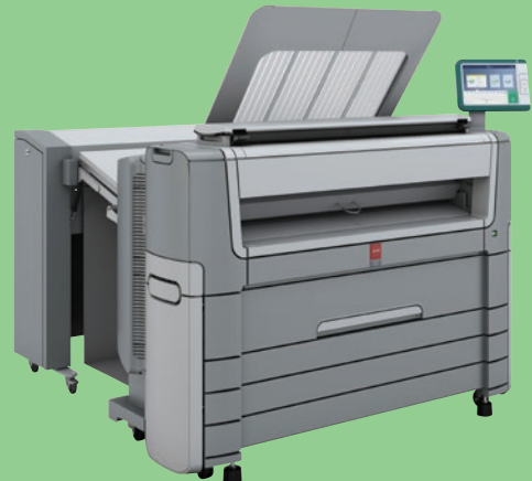
MULTIFUNCTION SYSTEM WITH OPTIONAL OCÉ 2400 FANFOLD