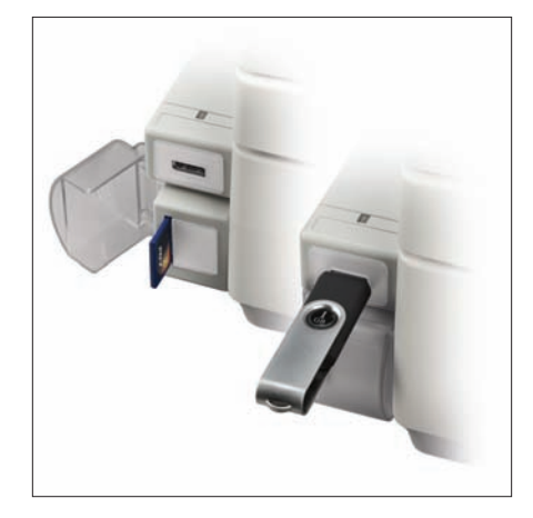
Load scanned documents to portable media using Scan-to-Media capabilities with the USB/SD card slot and print TIFF, PDF and JPG files virtually anywhere.