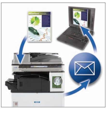
Color scanning combined with innovative Scan-To capabilities promotes cost-free document distribution and less taxing network traffic.