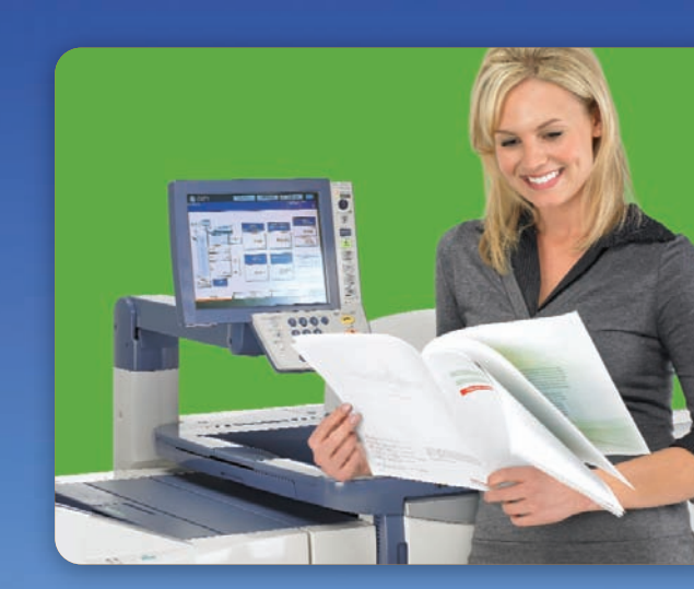
With color copy speeds up to 65 ppm, exceptional graphic art color is finally being delivered at the speed of business.

To say there has never been a multifunction system quite like this before would not be an exaggeration. Toshiba has taken more than 130 years of leading innovation—with 60 of those years including office equipment—and produced the flagship e-studio5520c/6520c/6530c Series. High quality color images are delivered at up to 65 pages per minute, with black and white delivered at up to 75 pages per minute. Advanced security features meet the demanding needs of a variety of office equipment. Various operations have been designed to be the most user-friendly to date. For instance, a 10.4" super VGA control panel includes one-touch access keys for all major functions. It also offers large text and an interactive copier diagram. And with over 500 patents pending, this Series is, quite literally, one of the biggest breakthroughs in color multifunction products since color printing.