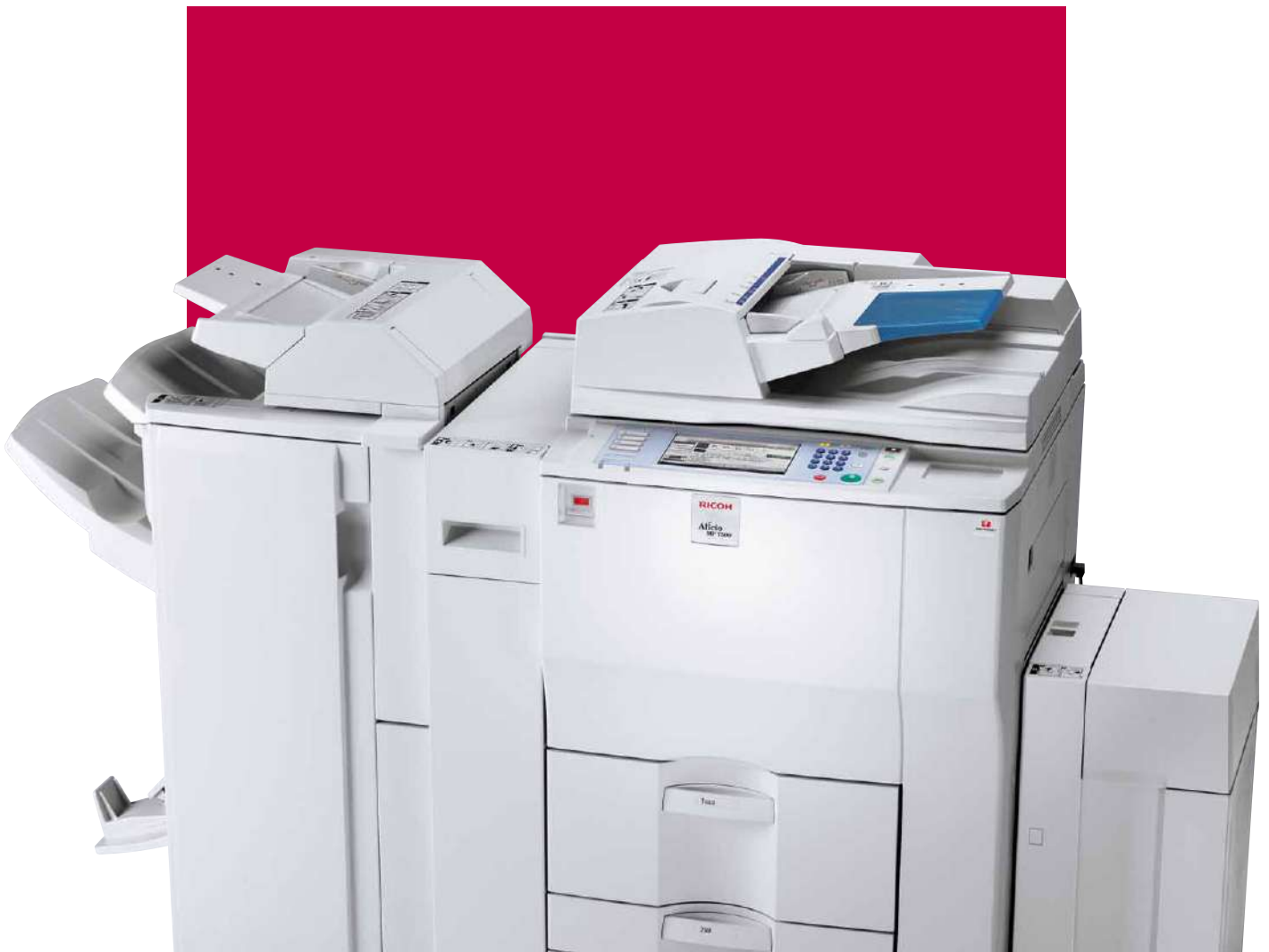
Aficio™ MP 7500