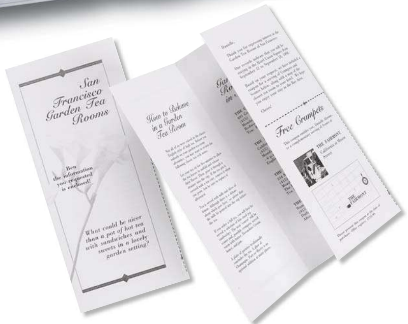
▲ C- or Z-FOLD MAILERS