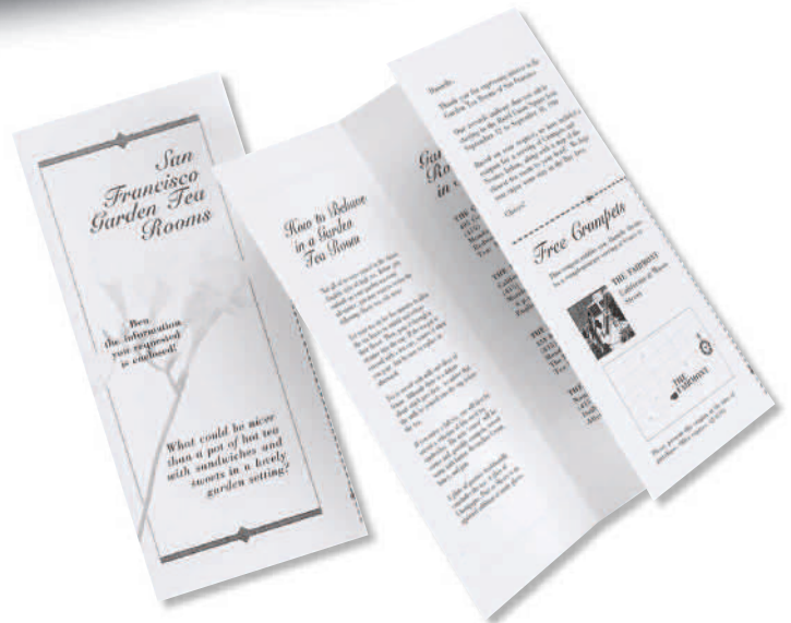
▶ C- or Z-FOLD MAILERS