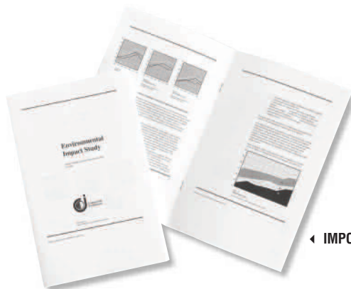
◀ IMPOSED BOOKLETS

Your applications need to be more than just toner on paper if they're going to help you get to the top. With versatile finishing options such as stapling, booklets, and Z-fold, C-fold, and bi-fold, as well as support for tabs, and the ability to insert full-color covers, the Xerox 4590 is well-equipped to deliver standout, high-value applications that get great results.