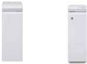
Interface Module (required to support finishing modules) [Left]