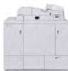
Xerox® Perfect Binder*

Enhance your professional finishing even further with creased cover sheets, face trimming and control of trim and square fold thickness. Create crisp, sharp square spine booklets that can be opened flat and are easy to handle, stack and store.