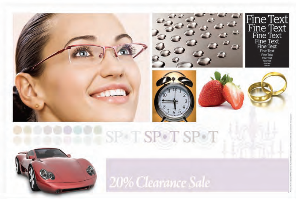
Base image without clear dry ink areas.

The creative options you can offer by adding this new, clear dry ink capability can help you become a true partner to your customers. You can advise customers already expert in design and layout on how to set up their files properly for this additional clear layer to achieve their desired effect. Or you can offer creative value to customers when they deliver their files, by adding some of these effects right at your print server.