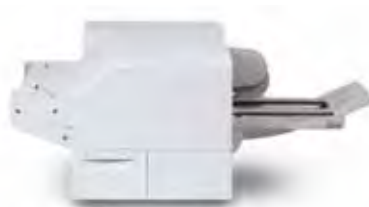
Xerox® SquareFold® Trimmer Attaches to the optional Booklet Maker Finisher

Incorporating all of the features of the Standard Finisher, plus booklet-making capabilities. Ideal for large booklets and calendars, up to 25 sheets with 100 imposed pages, 100 imaged sides. Excellent handling of approved coated stocks along with saddle-stitch and bi-fold capabilities.