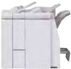
Booklet Maker Finisher with Optional C-Z Folder (25 sheets or 100 page booklets)

Enhance your standard finishing applications with convenience and flexibility. Variable length stapling for up to 100 sheets delivers neat output, regardless of your document size. Hole-punching saves time and money, while the optional folder enables you to create applications featuring bi-fold, C-, Z- and Engineering Z-folding.