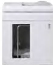
High Capacity Stacker (Single or Dual) up to 5,000 Sheet Removable Cart (Top Tray 500 Sheets)

Create professionally bound documents in-house by combining printing, punching and collating in one convenient step. Ideal for punched applications such as manuals, guides and planners.