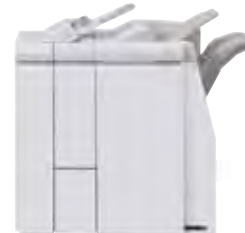
Standard Finisher with Optional C-Z Folder (2-100 sheets, 3-position variable length stapler)

Your choice for long production runs, removable carts make it easy to unload your large jobs. Dual stackers support unload-while-run capability so you can be even more productive.