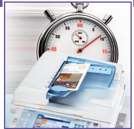
With fast warm-up and recovery times, these models save both time and energy.