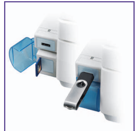
Print documents directly from a USB drive or SD card. Just plug in and print without connecting to the local network.