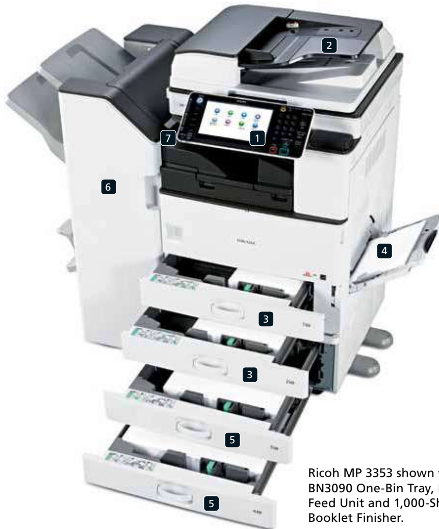
Ricoh MP 3353 shown with optional BN3090 One-Bin Tray, PB3180 Paper Feed Unit and 1,000-Sheet SR3150 Booklet Finisher.