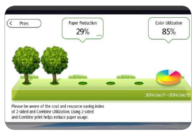
Eco-Friendly Indicator Screen as shown on Smart Operation Panel.

We strive to be stewards for the environment. That's why we give you more ways to take responsibility for your own energy and paper use. The Ricoh MP C401/MP C401SR offers expanded energy-saving modes to reduce power consumption. Program it to shut down or power up automatically to conserve energy during expected downtimes. Take advantage of standard duplexing to reduce paper and associated costs. Set print quotas for individual users or groups to reduce unnecessary printing. And, use the built-in Eco-Friendly Indicator to see how much paper your team is saving. These models meet the new stringent standards for ENERGY STAR<sup>™</sup> 2.0 certification and have qualified for an EPEAT® gold rating.