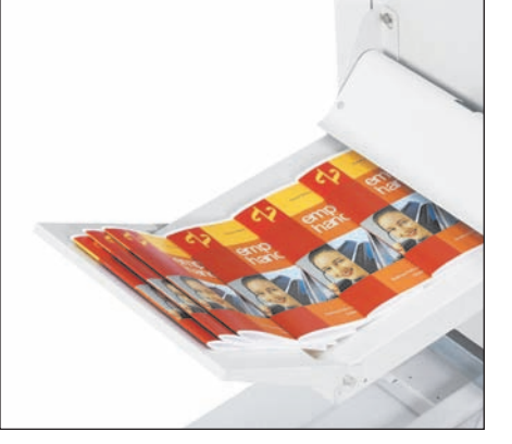
Create saddle-stitch square fold booklets up to 120 pages.