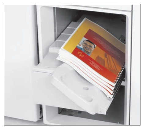
In-Line Ring Binding—with the new Ring Binder RB5000—eliminates the time and expense of inserting binding elements off-line, dramatically saving time and labor.