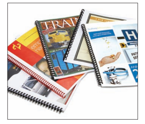
Use the GBC StreamPunch III to produce clean, precisely punched documents in a range of styles.