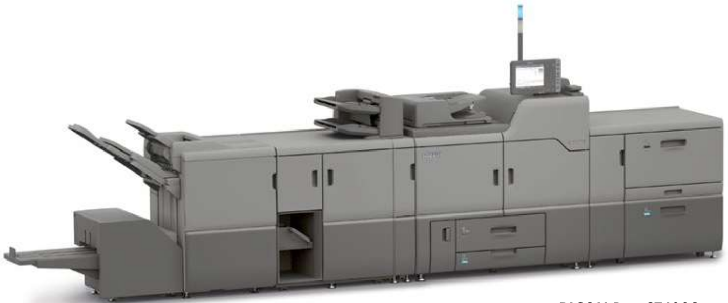
RICOH Pro C7100S

For maximum performance and yield, we recommend using genuine Ricoh parts and supplies.