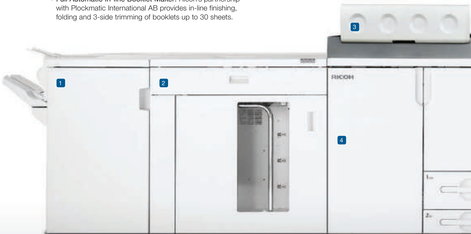
Ricoh Pro C901/C901s Graphic Arts +