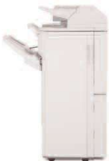
SR4030 3,000-Sheet Finisher with 50-Sheet Stapler and Cover Interposer Tray Type 3260

Create a configuration that delivers the options your customers need. Choose from 3 different types of optional finishers and a Cover Interposer.