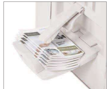
Use the Saddle-Stitch Finisher to create saddle-stitched booklets for handouts, educational and training materials and many other applications.