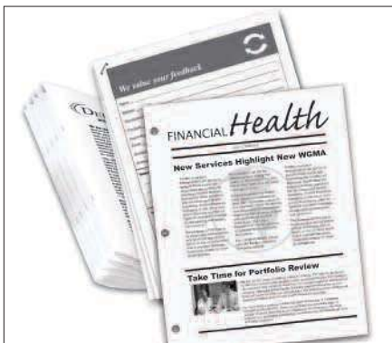
The Savin 9090 series enables you to produce more finished documents in-house and reduce outsourcing costs.