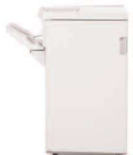
SR4050 3,000-Sheet Finisher with 100-Sheet Stapler