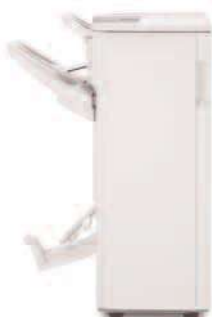
SR4040 2,000-Sheet Saddle-Stitch Finisher with 50-Sheet Stapler