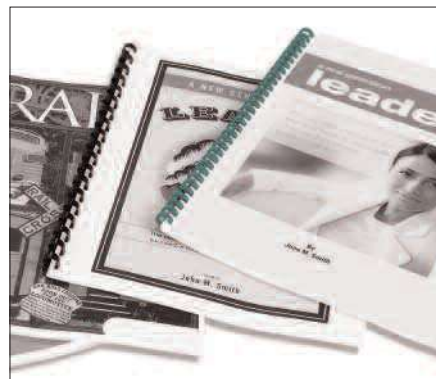
The GBC StreamPunch III delivers cleanly punched documents in several styles.