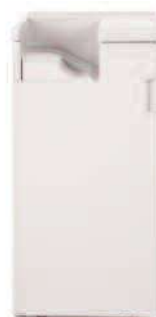
FD5000 Multi-Folding Unit