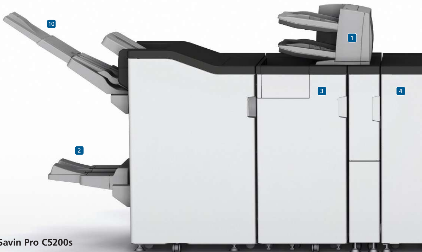
Savin Pro C5200s