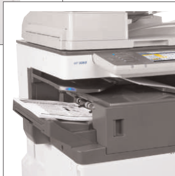
500-Sheet Internal Finisher