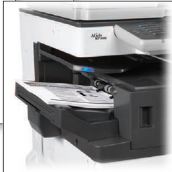
500-Sheet Internal Finisher