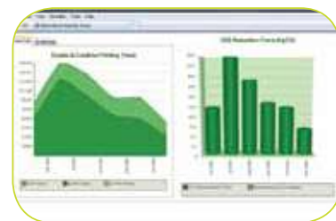
Translate usage data into reports that detail CO 2 reduction trends