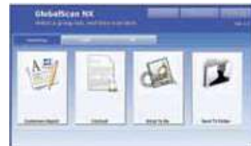
GlobalScan NX Project based scanning meets the needs of different business documents