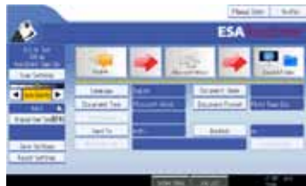
ESA Transformer Graphical icons for ease of use