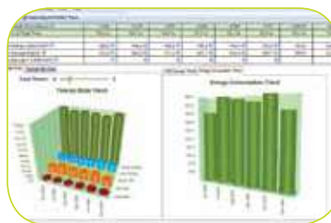
Track trends in energy consumption over time

* Formulas obtained from US Environmental Protection Agency - US Department of Energy