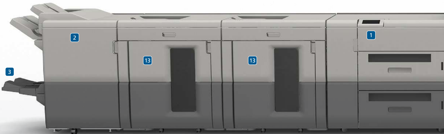
Savin Pro 8220s