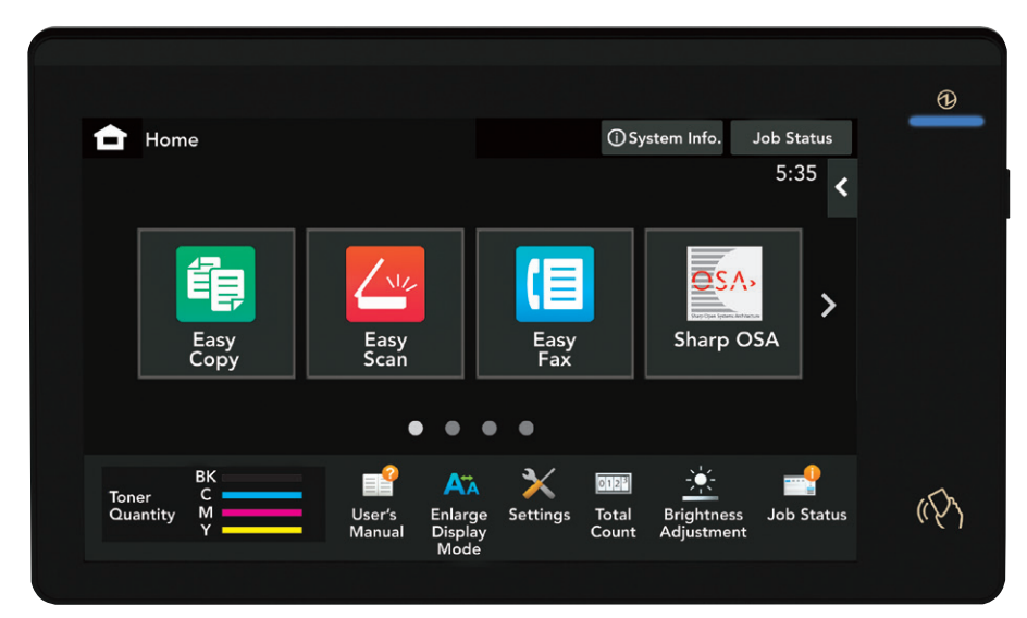
10.1" (diagonally measured) customizable touchscreen display.