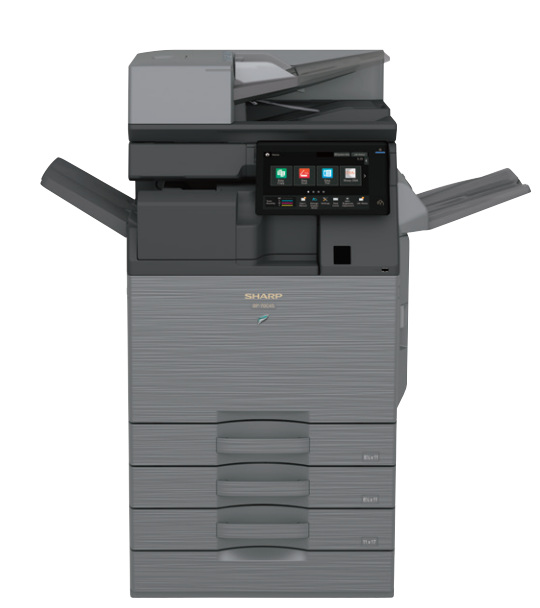
BP-70C45 shown with Inner Folding Unit, Right Side Exit Tray and 2-drawer Paper Deck.