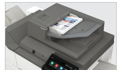
High capacity 300-sheet DSPF scans documents at up to 280 images per minute.