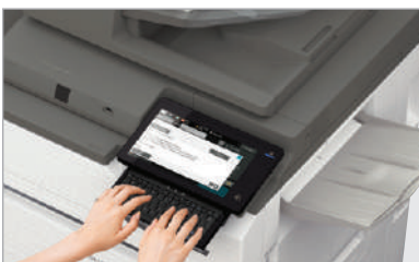
Built-in retractable keyboard simplifies email address and subject line entries.