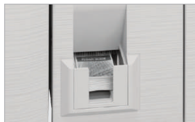
Folding Unit option offers a variety of fold patterns, including tri-fold, z-fold and others.