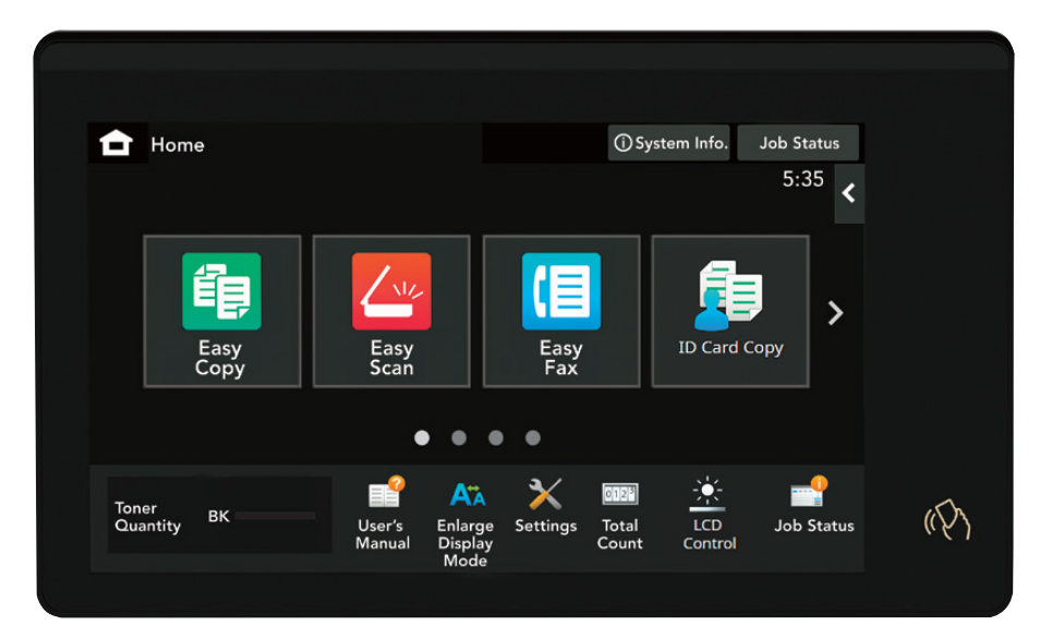
7" (diagonally measured) customizable touchscreen display.