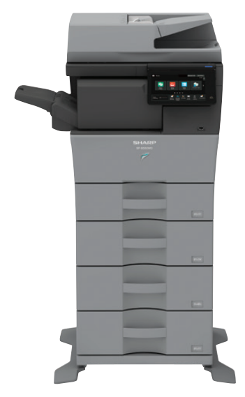
BP-B550WD shown with Inner Finishing Unit in a 4-drawer configuration.