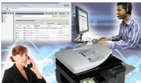
Sharp Remote Device Management