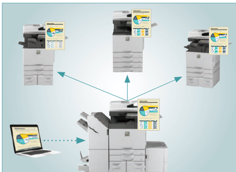
With serverless Print Release technology you can securely print a job and release it from any of five color Essentials Series models.