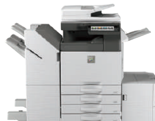
MX-4050N shown with 3K saddle stitch finisher and large capacity cassette.