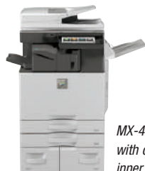
MX-4050N shown with compact inner finisher.

When it’s time to get the job done, the Essentials Series color document systems are outstanding performers. Quickly scan documents at speeds up to 80 images per minute . Then use the manual stapling feature on select finishers to restaple your originals. Multiple finishing options give you the output you require, be it stacked, stapled, or saddle-stitched. There’s even an available built-in stapleless staple feature, which can bind up to five sheets of paper by adding a crimp to the corner of the set, saving regular staples for larger sets.