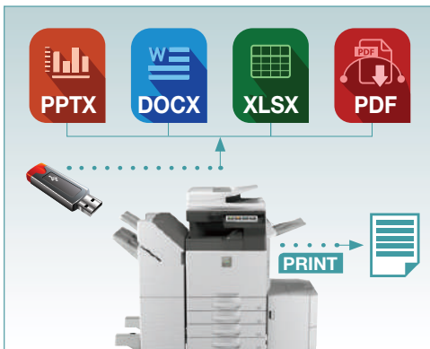
Direct print to popular file formats seamlessly with Sharp's available direct print expansion kit. 1