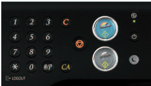
Separate print buttons for B&W and Color allow users to selectively manage use of color

Managing all of the advanced features of your Sharp product is simple and easy. Ask your Authorized Sharp Dealer about the My Sharp website . This dedicated customer training website is customized to your MX-2616N/MX-3116N and allows you to locate resources and find information specific to your configuration, truly helping you maximize your investment.