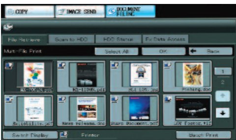
Sharp's easy-to-use Document Filing System with thumbnail preview