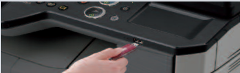
USB 2.0 port is located on the front panel for easy access*

Impressive workflow efficiency with leading edge features that help deliver optimum results.