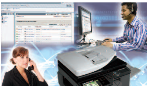
Sharp Remote Device Management