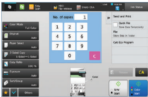
Standard Copy Screen offers more advanced features.