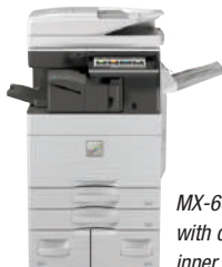
MX-6070N shown with compact inner finisher.

When it's time to get the job done, the Advanced Series color document systems are outstanding performers. Quickly scan documents at speeds up to 200 images per minute . Built-in optical character recognition (OCR) can convert your scanned documents into text-searchable PDFs or Microsoft Office file formats, simplifying your workflow. Use the manual stapling feature on select finishers to restaple your originals. Multiple finishing options give you the output you require, be it stacked, stapled or saddle-stitched. There's even an available built-in stapleless staple feature, which can bind up to five sheets of paper by adding a crimp to the corner of the set, saving regular staples for larger sets.