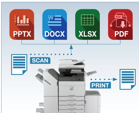
Scan and convert documents to popular file formats seamlessly with Sharp's built-in OCR function.