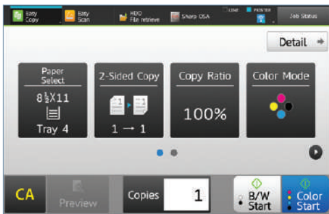
Easy Copy Screen offers the most commonly used settings.