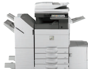
MX-6070N shown with 3K saddle stitch finisher and large capacity cassette.