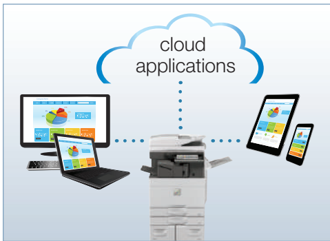
Distribute, access and print documents more easily.