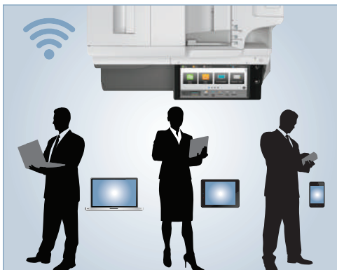
Built-in wireless network interface for convenient scanning and printing from mobile devices.

From paper handling to networking, the MX-5070N and MX-6070N color Advanced Series will exceed your expectations.