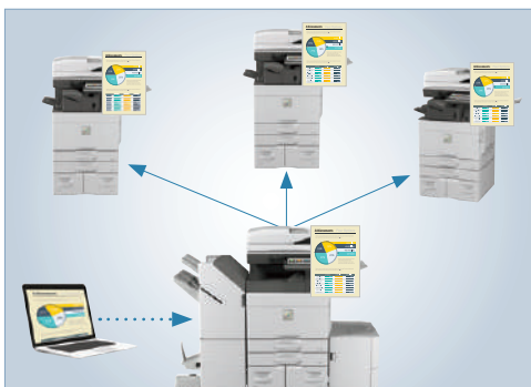
With Serverless Print Release technology you can securely print a job and release it from any of six color Advanced Series models.