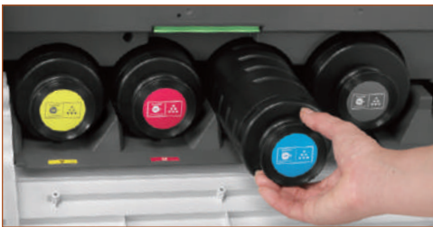
On-the-fly toner cartridge replacement while your job is running helps maximize your productivity.