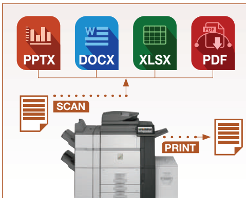
Scan and convert documents to popular file formats seamlessly with Sharp's built-in OCR function.