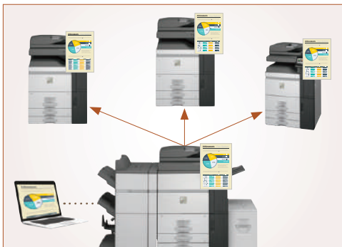
With Serverless Print Release technology you can securely print a job and release it from any of six supported models. 1

Versatile document workflow solutions provide you with extensive benefits to help your bottom line.