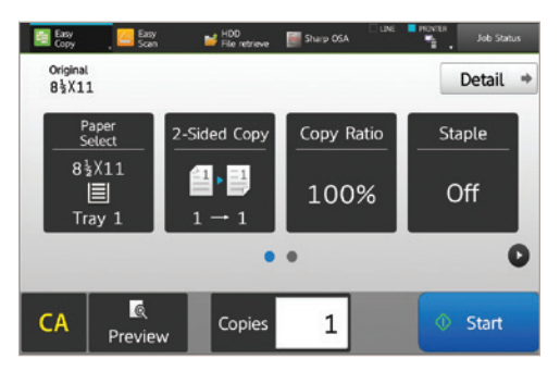
Easy Copy Screen offers the most commonly used settings.