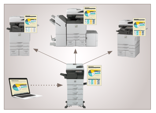
With Serverless Print Release you can securely print a job and release it from up to six Sharp MFPs (including host).