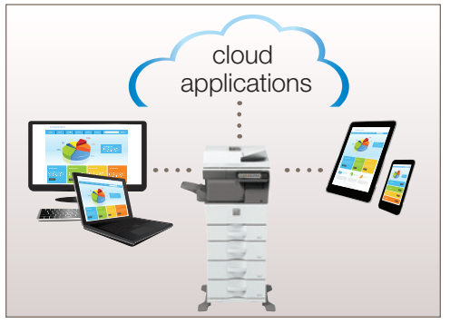
Distribute, access and print documents more easily.