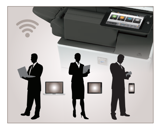
Built-in wireless network interface for convenient scanning and printing from mobile devices.