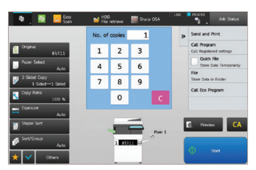
Standard Copy Screen offers more advanced features.