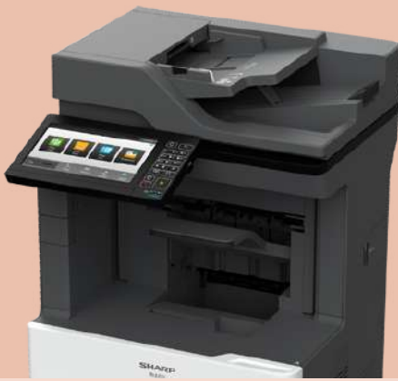
MX-B557F shown with optional inner finisher