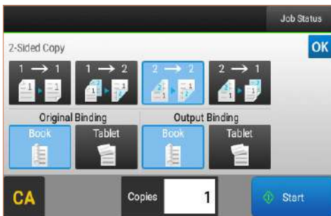
Easily copy documents in 1-sided or 2-sided formats.