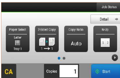
Easy Copy screen offers the most commonly used settings.