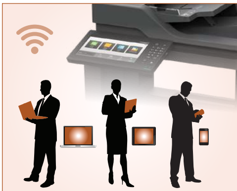
Optional wireless network interface for convenient scanning and printing from mobile devices.

*Some features require optional equipment and/or software/services.